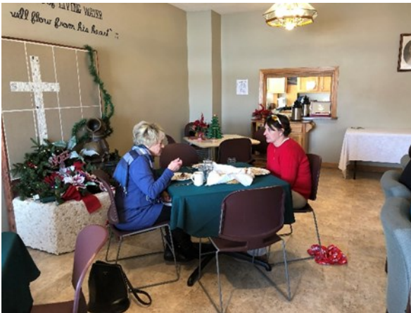
Sunday Friendship Hour

There will come a time in all our lives where we will need someone to walk with us down a tough road. Maybe we've already experienced this. This ministry allows us to care for one another during dark times and to be in ministry with those who simply cannot make it into our building for whatever reason. This budget item also serves the hospitality and accessibility of our church when someone does come in.