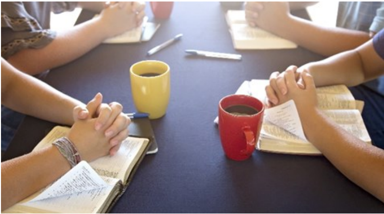
Sunday Scripture Study Adult Small Groups, Women's Bible Study

We are committed to providing opportunities for adults of all ages to walk together for the purpose of growing their faith. Our adult ministry programs bring men and women together as they seek to honor God in their homes, careers, relationships, finances, and more. We want to create a network of support for adults in our community to connect with one another on a regular basis for a specific purpose—to know and experience Jesus in community with others. Through small groups, classes, and monthly gatherings, we connect adults together as they connect with Christ.