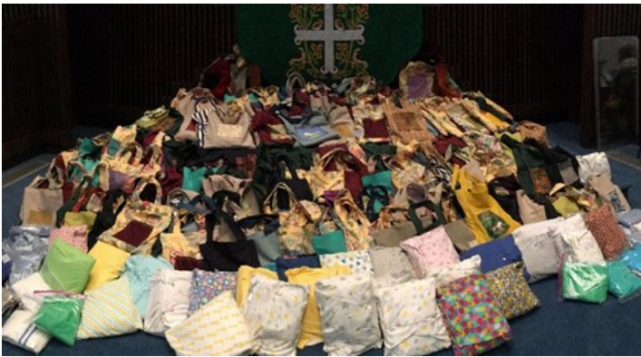
School Kits, Hygiene Kits, and Layettes for the United Methodist Committee on Relief

This work is the front edge of our church. Taking us out past our walls and into the world to be the hands and feet of Jesus. This team has worked diligently on projects to make our church greener and more outward focused. The numbers here also includes our support of Care & Share, Philips Cupboard, Bridge the Gap, The United Methodist Committee on Relief, and our missionaries. You will also see our Apportionments numbers fall here because this money is what enables our denomination to be a mission presence around the world.