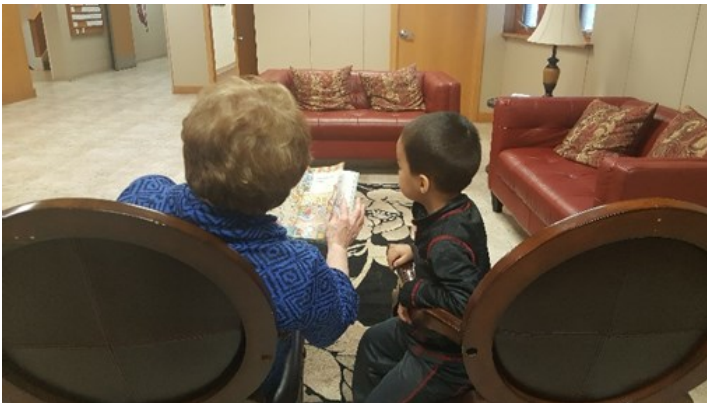
Change a Child's Story