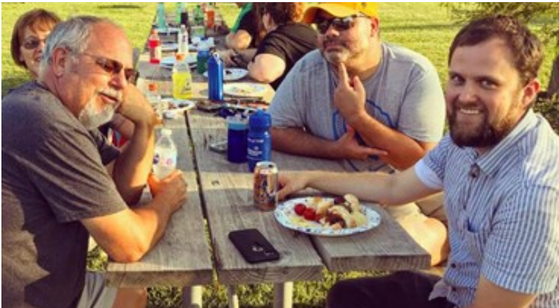
Summer Bibles and BBQ